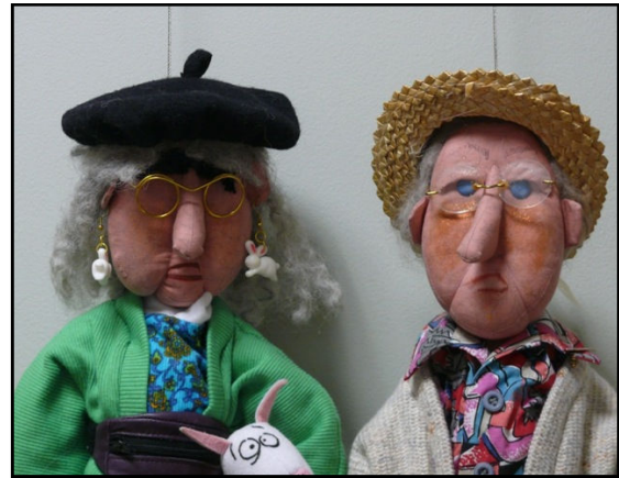
elinor peace bailey dolls at The Arboretum